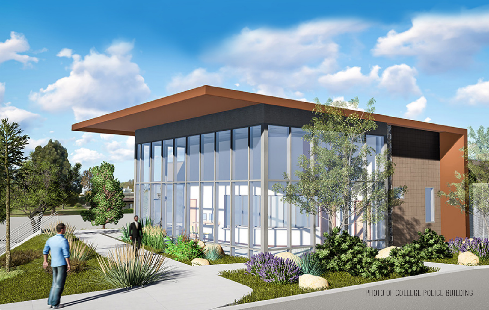
PHOTO OF COLLEGE POLICE BUILDING