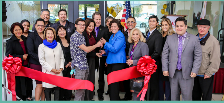
The community joined Southwestern College to celebrate the grand opening of the Plaza Building in February.

Medical Laboratory Technician Program students achieved a 100 percent pass rate on their national certification exam and many graduates even secured employment prior to graduation. The Medical Office Professions