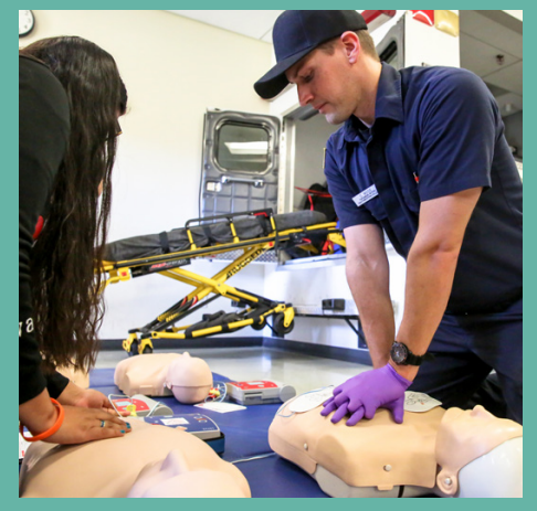
Paramedic students lead hands-on workshops on how to perform CPR during Otay Mesa's 10th anniversary celebration.

Business Development Center (SBDC) Network, the San Diego Contracting Opportunities Center (SDCOC) and the San Diego Center for International Trade Development (CITD). In total, the programs have created $339,871,520 in economic impact (a mix of sales, contract, capital); created 1,560 jobs; and served more than 2,550 businesses.