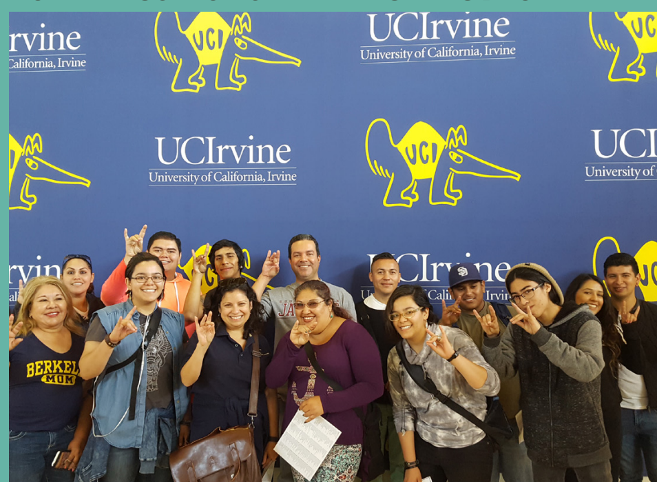
San Ysidro students added university visits to their activities this year as part of the First Year Experience.

The Higher Education Center at San Ysidro continues to evolve its services. thanks to feedback from its students. This year, the center launched its own First Year Experience Program, a program for recent high school students with no college coursework that sets them on pathways to success. The program included dedicated counseling, a mentorship program and field trips to UCLA, UC Irvine and CSU Long Beach. The center continues to be a transfer-driven institution by exposing students to transfer opportunities and developing the most Student Education Plans of any of the other Higher Education Centers. This year the center also strengthened its relationships with San Ysidro High School and Southwest High School to continue to find ways to better serve its community of students. In October, the center held a community forum where students and community members contributed ideas to the possible expansion of the center.