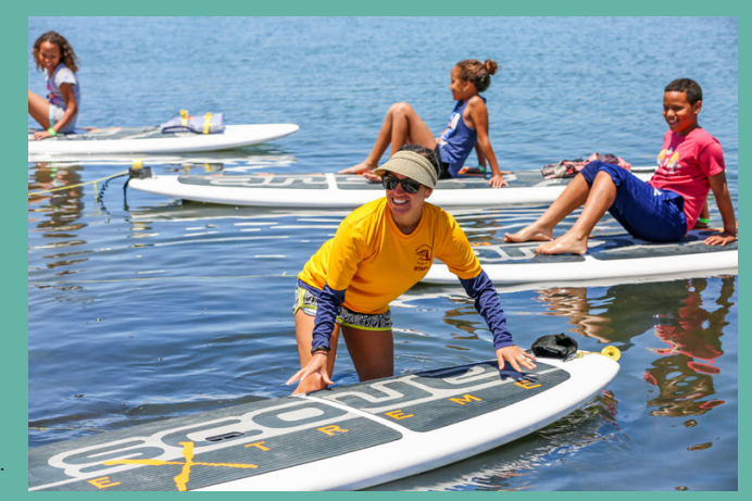
Students experience yoga on the water.

The center is also a designated American Heart Association Community Training Center, which allows the center to give safety certificates and training in CPR, first aid and automated external defibrillator. As a service to San Diego County, the center also provides private lessons and aquatic youth camps for children ages seven to 17.