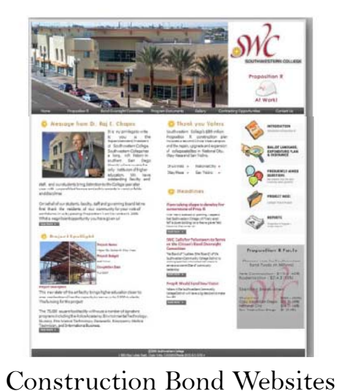
Southwestern College - Proposition R Bond Website