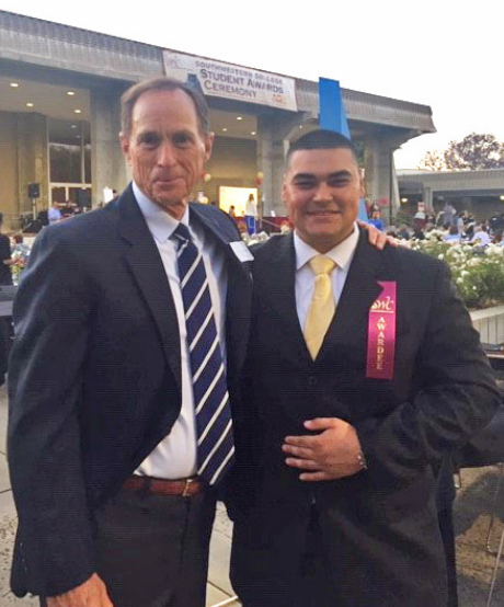
Devore Family Memorial Scholarship presented to SWC student who went on to graduate from SDSU